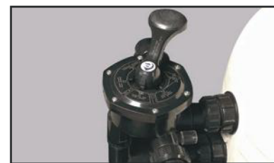
Equipped with a 6-way multiport valve