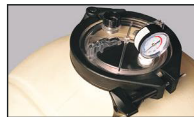
Easy-to-read pressure gauge for inspection