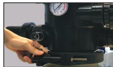
Unique one-piece clamp with screw-type lock design to simplify installation and allows tool-free serving

Emaux's innovative design and advanced technology offer superior filtration performance and crystal clear water. Max series filters are seamless, one-piece blow-molded filter tank in high density polyethylene for heavy duty use and reliability.